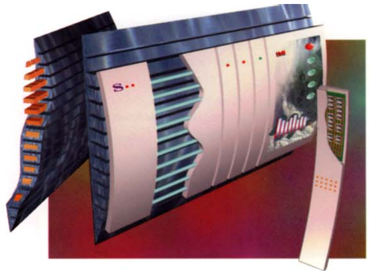
The Sontex wall-mounted home computer, introduced in 1988, features a variety of coatings, each for a specific purpose.

These new materials and processes also led to the refinement of free-form fabrication technology, which was commercially introduced in 1987 with the presentation of stereolithography. The new century brought new techniques based on the use of different plastics, metal powders, ceramics and even composites to expand the size and selection of parts. Other methods included solid ground curing, selective laser